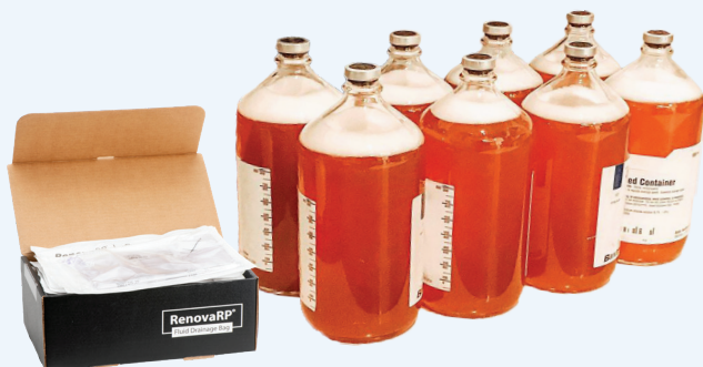
Renova Bags (1 Box) vs. 1L Bottles (x8)