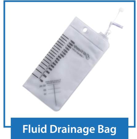
Fluid Drainage Bag